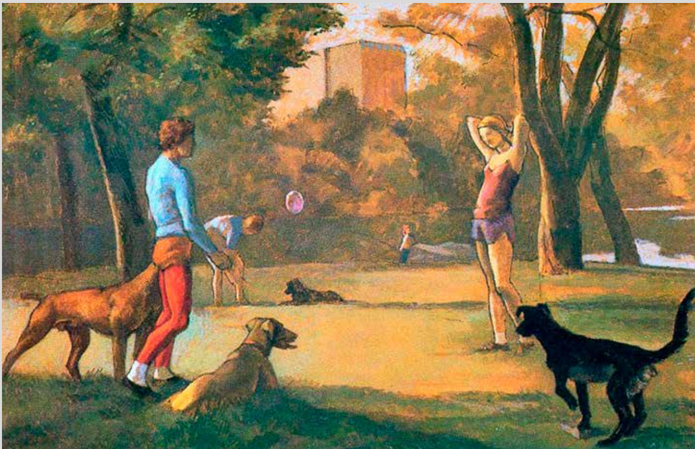
„Akteonovo popodne”, 1983, gvaš na papiru, 33 x 51 cm An Afternoon of Acteon, 1983, gouache on paper, 33 x 51 cm