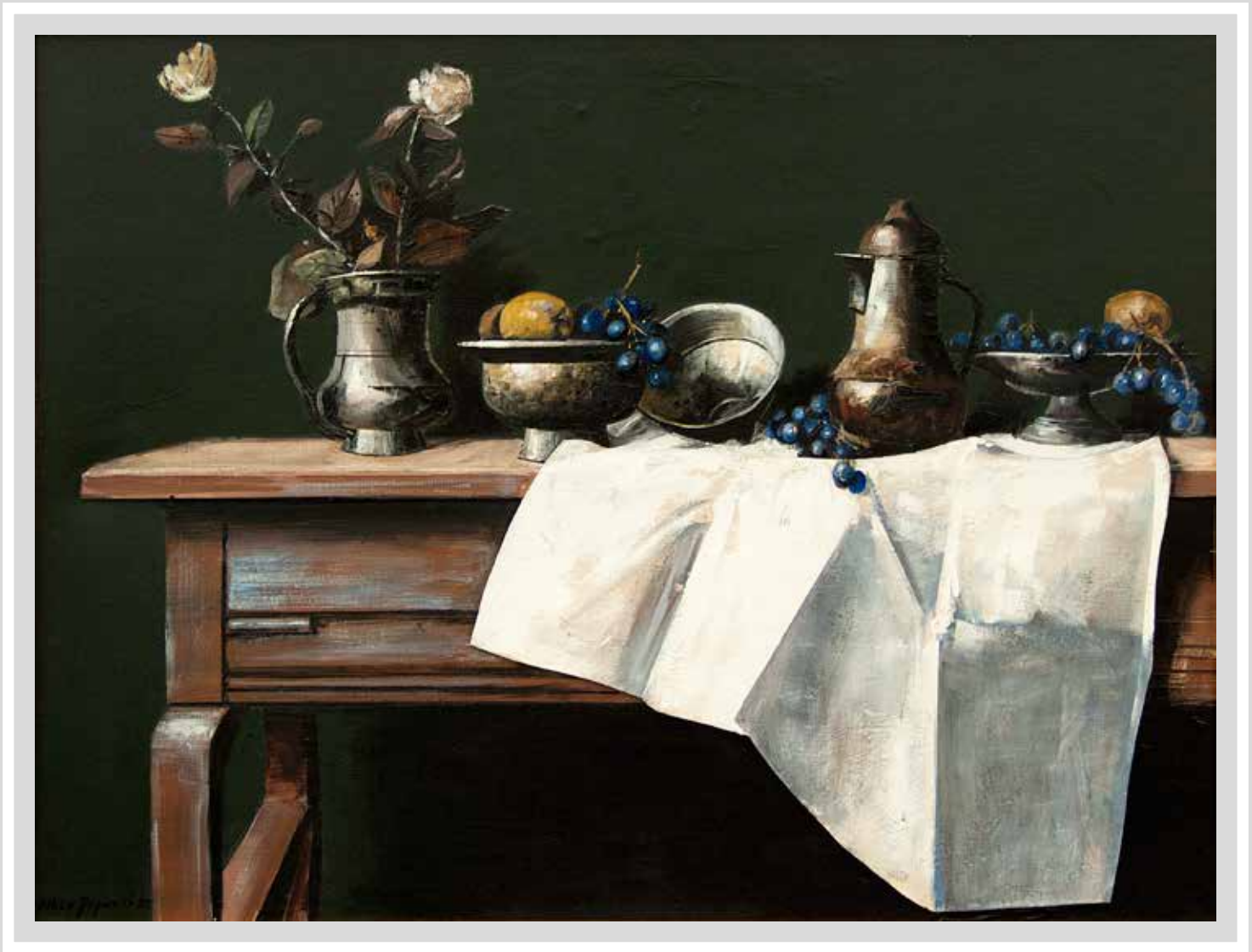
„Velika mrtva priroda”, 1989, akrilik na platnu (kombinovana), 100 x 130 cm Large Still Life, 1989, acrylic on canvas (combined), 100 x 130 cm