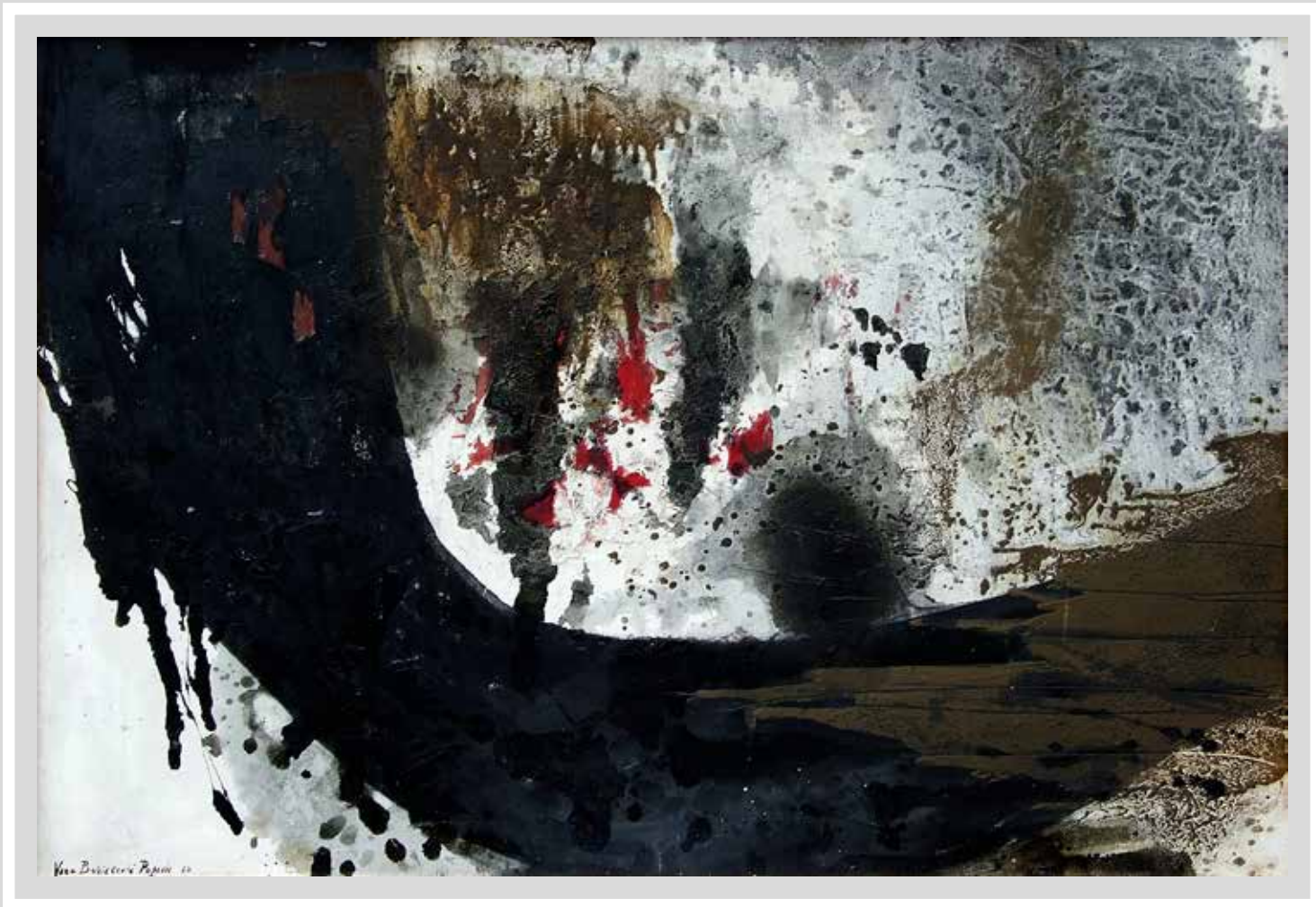
„Tok“, 1964, kombinovana tehnika na platnu, 112 x 160 cm The Flow, 1964, combined technique on canvas, 112 x 160 cm