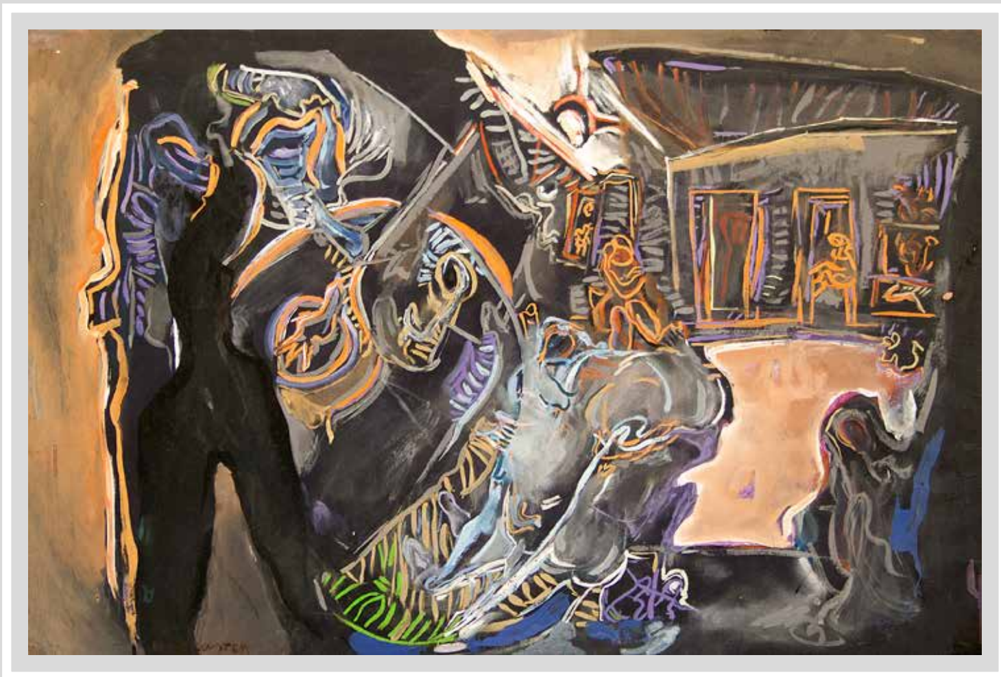
„Bez naziva”, akril na papiru kaširanom na platno, 84 x 127 cm No Name, acrylic on paper laid on canvas, 84 x 127 cm