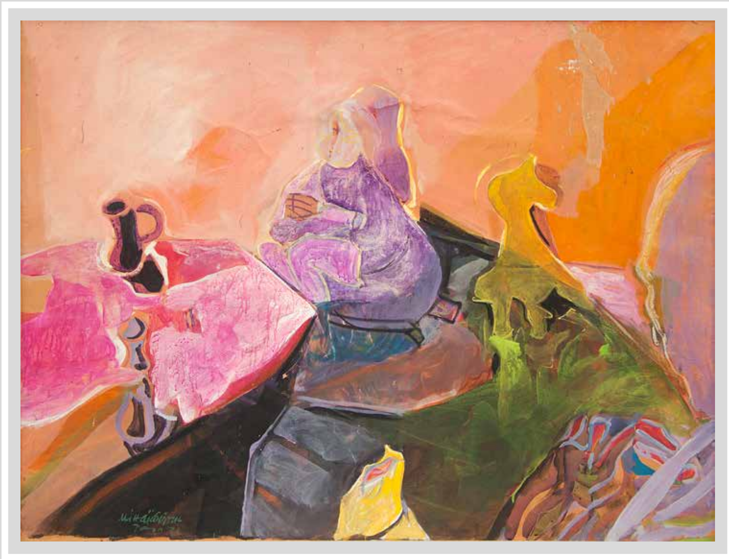
„Maroko”, 1972, ulje na platnu, 96 x 127 cm Morocco, 1972, oil on canvas, 96 x 127 cm