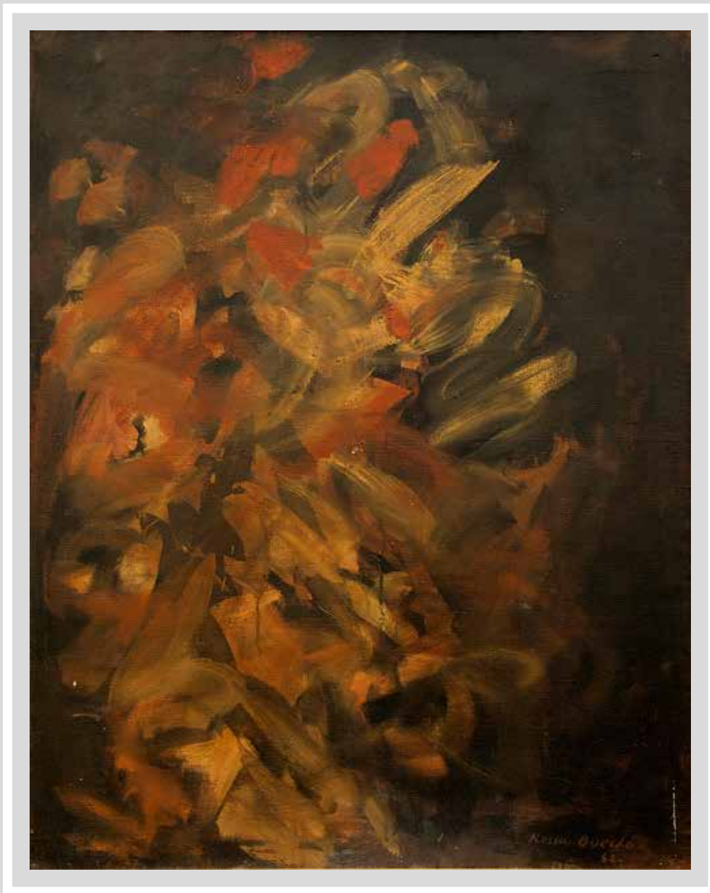
„Kukuruzi”, 1962, ulje na platnu 130 x 100 cm The Cornfield, 1962, oil on canvas 130 x 100 cm