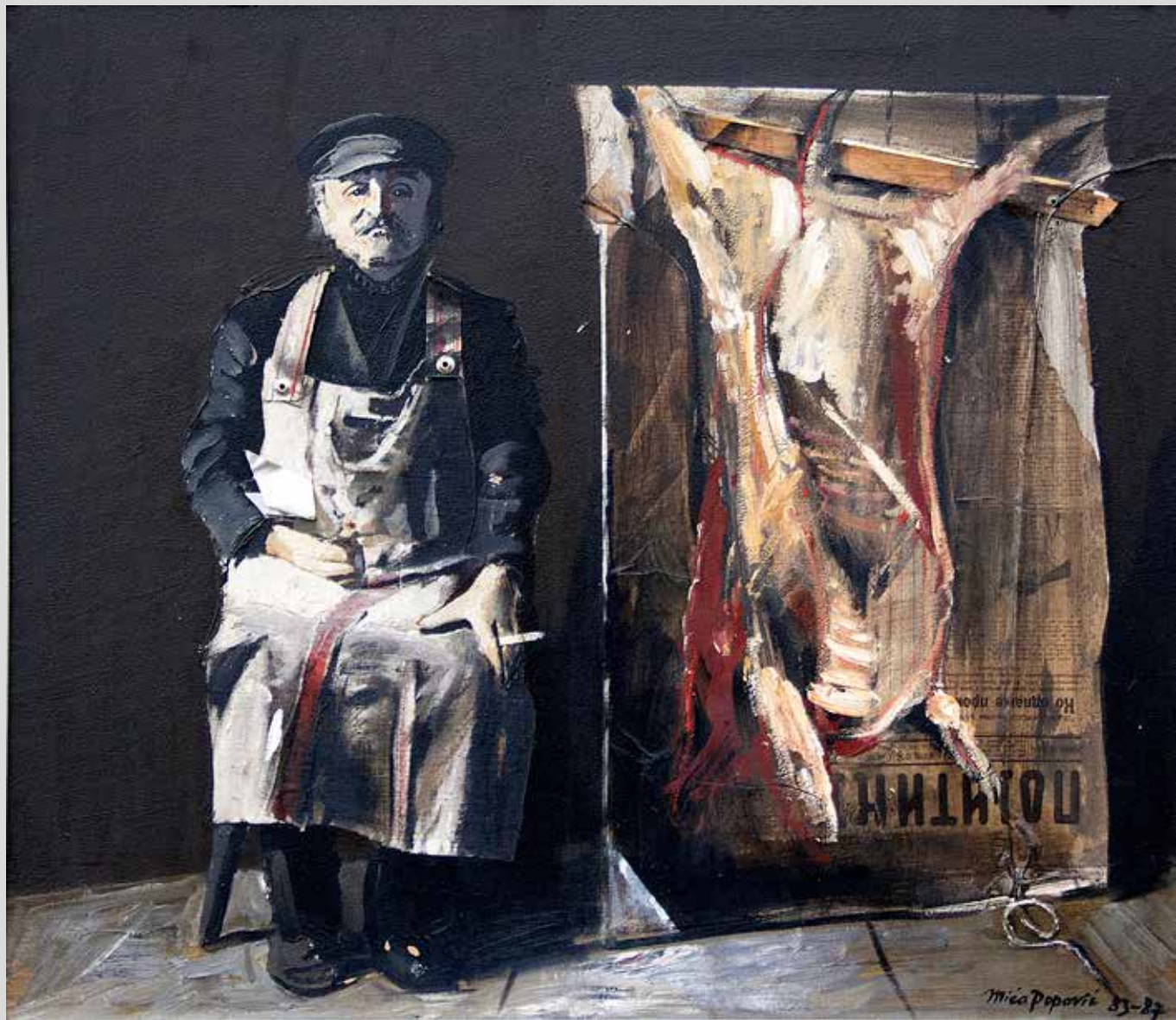
„U čast Rembrantu IV“, 1983-87, kombinovana tehnika na ploči, 70 x 80 cm In Honour of Rembrandt IV, 1983-87, combined technique on plate, 70 x 80 cm