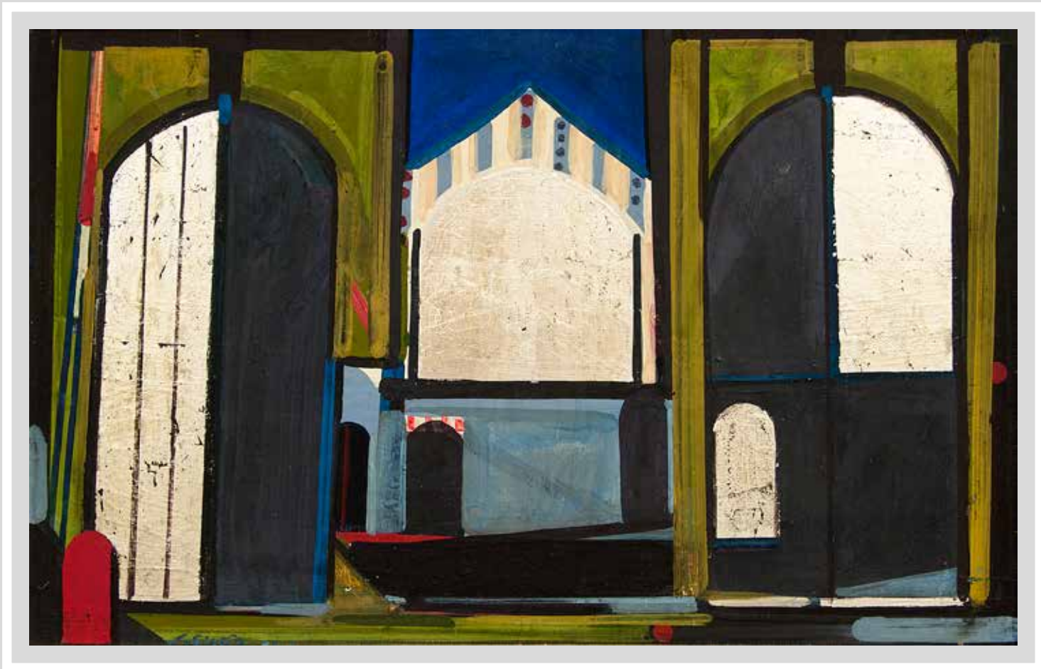
„Luka”, ulje na platnu, 49 x 77 cm Harbour, oil on canvas, 49 x 77 cm