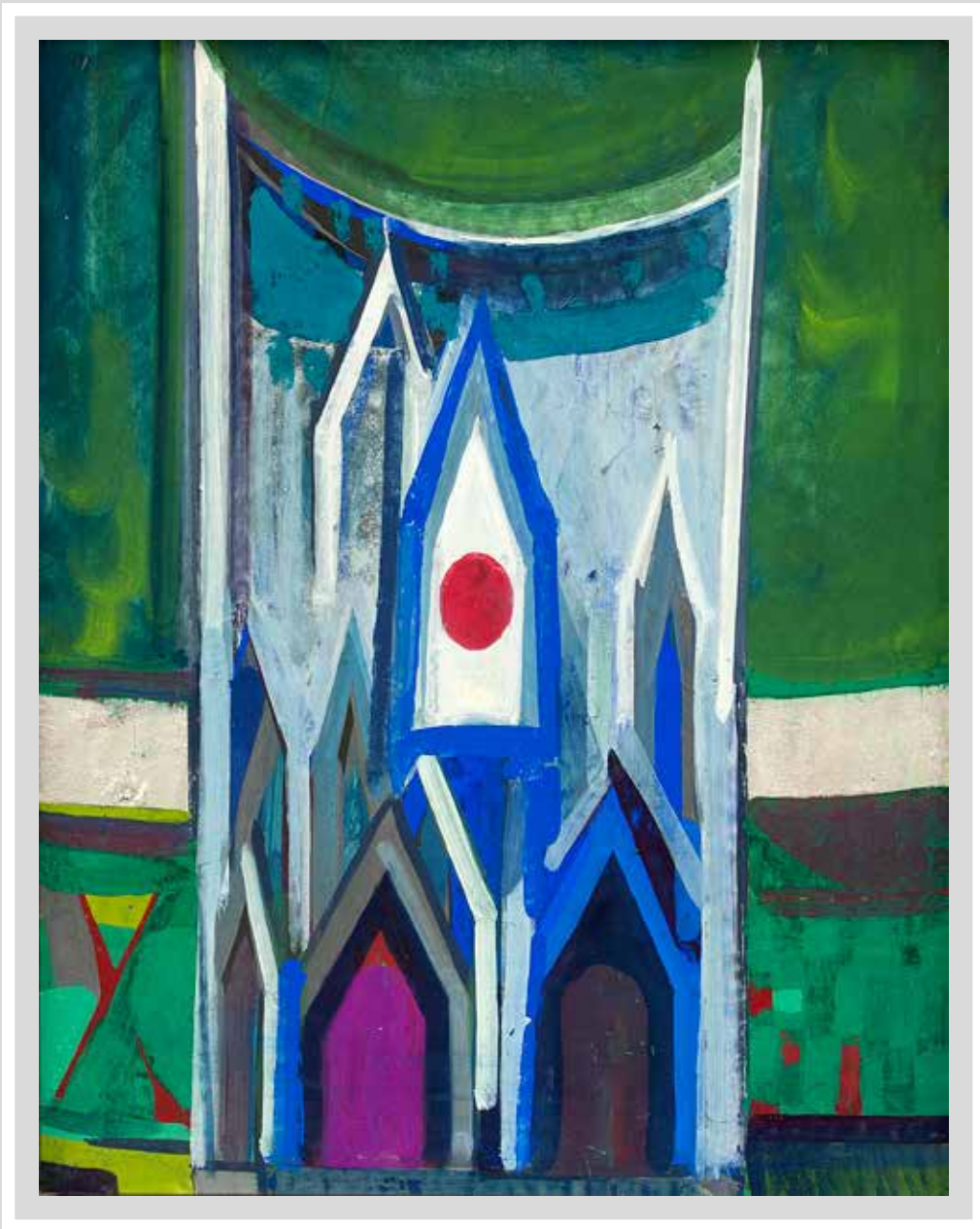
„Kompozicija”, ulje na platnu, 48 x 63 cm Composition, oil on canvas, 48 x 63 cm