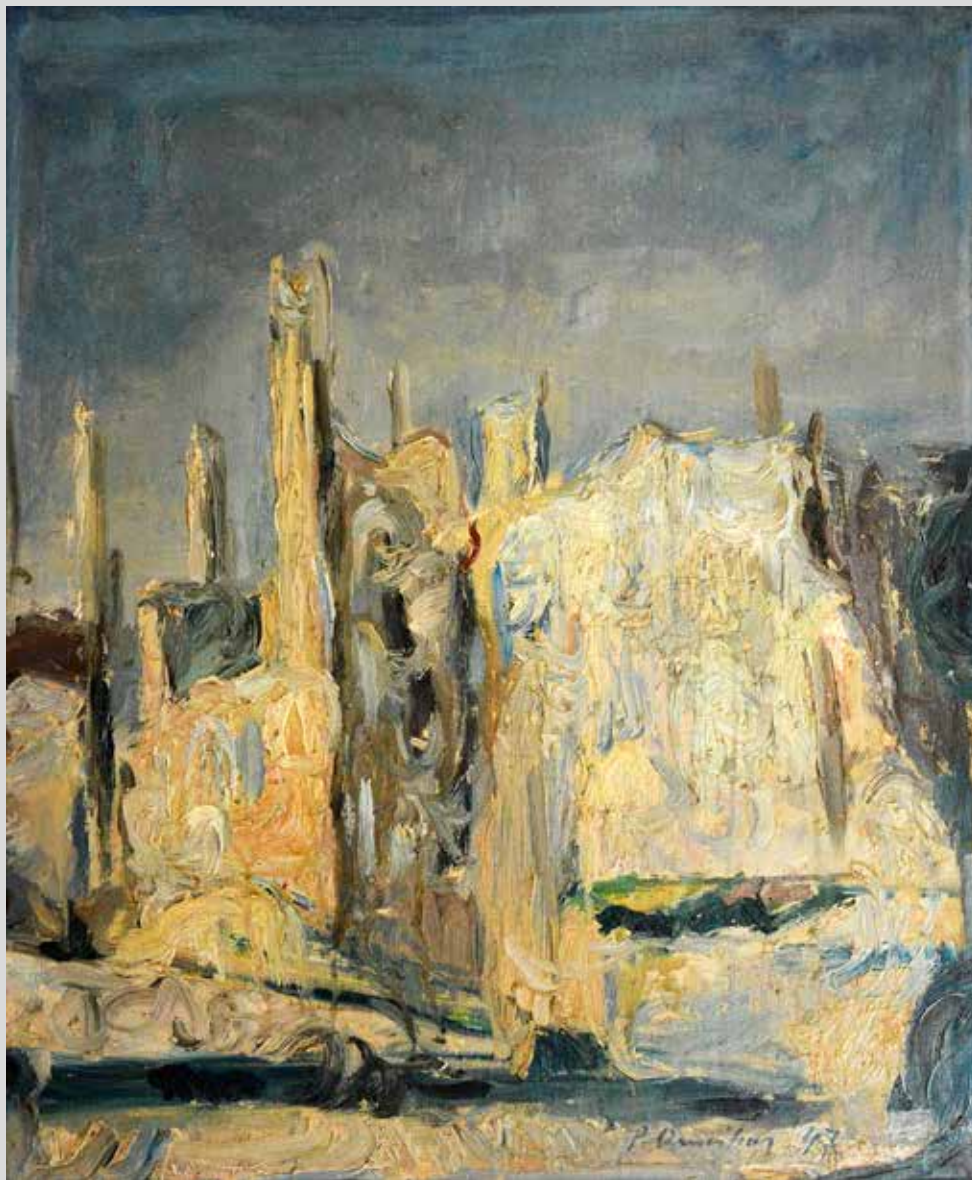
„Ruševine Zadra”, 1947, ulje na platnu, 62 x 50 cm The Ruins of Zadar, 1947, oil on canvas, 62 x 50 cm