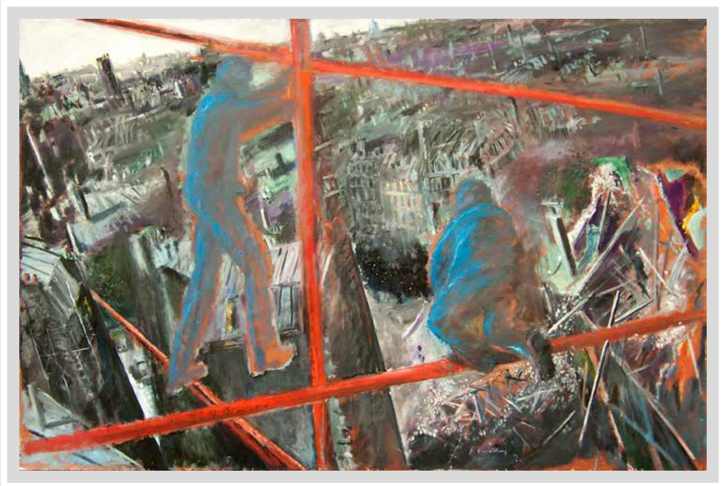
„Rušenje ateljea”, 1976, ulje na platnu, 135 x 190 cm Demolition of the Atelier, oil on canvas, 135 x 190 cm