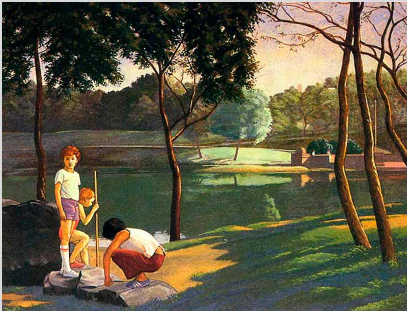
„Prilazeći Bethesda fontani”, 1978, kombinovana tehnika, tempera i ulje na platnu, 96,5 x 127 cm Towards Bethesda Fountain, 1978, combined technique, tempera and oil on canvas, 96,5 x 127 cm