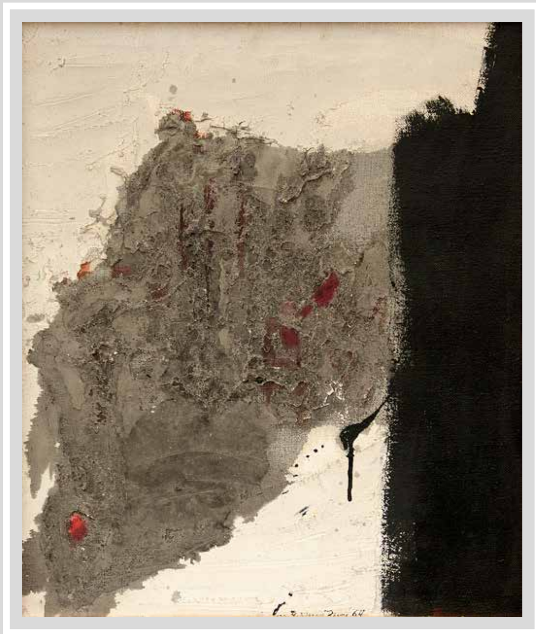
„Apstrakcija”, 1977, kombinovana tehnika na platnu, 54 x 65 cm Abstraction, 1977, combined technique on canvas, 54 x 65 cm