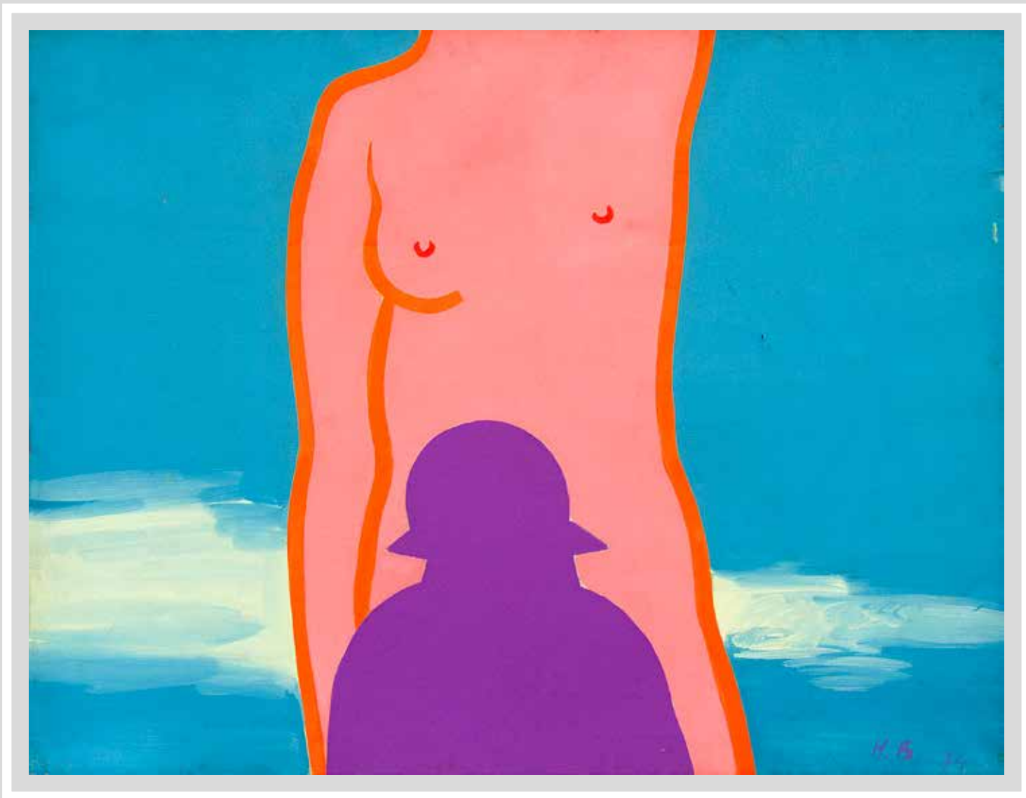
„U čast Magritu”, 1974, ulje na platnu, 120 x 150 cm In Honour of Magritte, 1974, oil on canvas, 120 x 150 cm